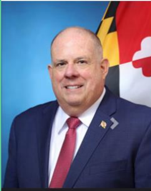
Governor Larry Hogan