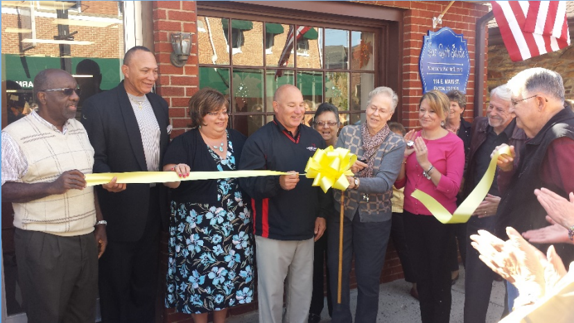
Suz Quilt Studio 114 East Main Street