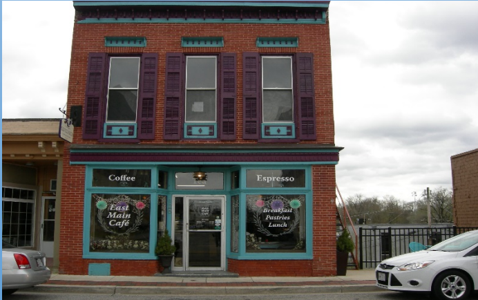
East Main Café 126 East Main Street