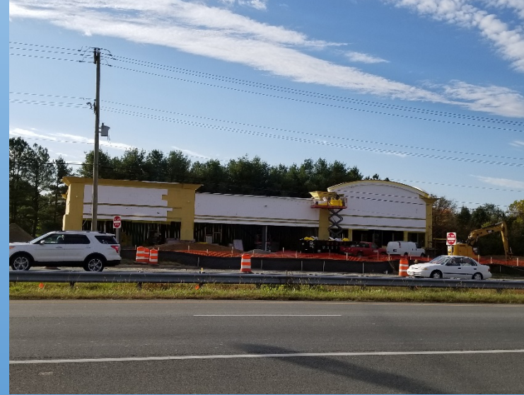
Fortress Steel 1001 Konica Drive, Upper Chesapeake Corporate Center