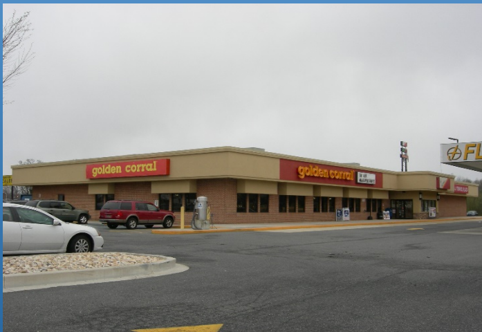
Golden Corral 221 Belle Hill Road