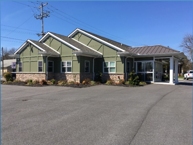
North Bridge Dental 400 North Bridge Street