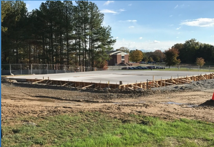
Singerly Fire Department Helipad