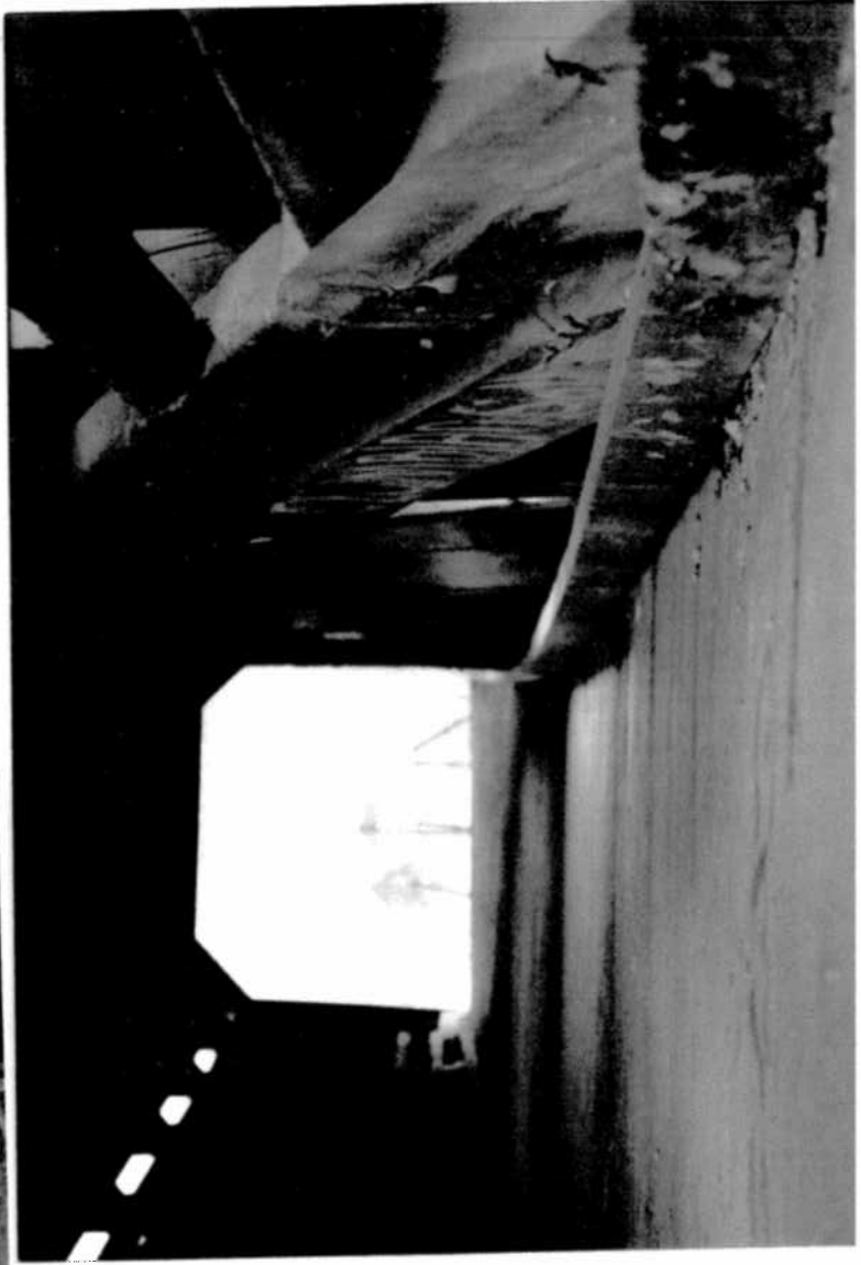
GILPIN FALLS COVERED BRIDGE